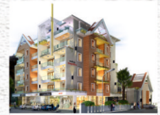
Walk-In Magnifica Kulshekar, Mangalore