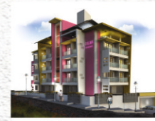
Delma Residency Kulshekar, Mangalore