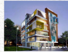
Louann Plaza Pandeshwar, Mangalore