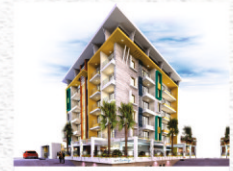
Walk-In Fantasy Commander George Martis Road, Kadri, Mangalore