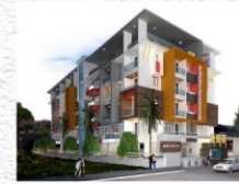
Walk-In Arcadia Commander George Martis Road, Kadri, Mangalore